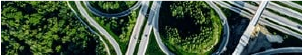
Select aluminium for a more sustainable automotive future