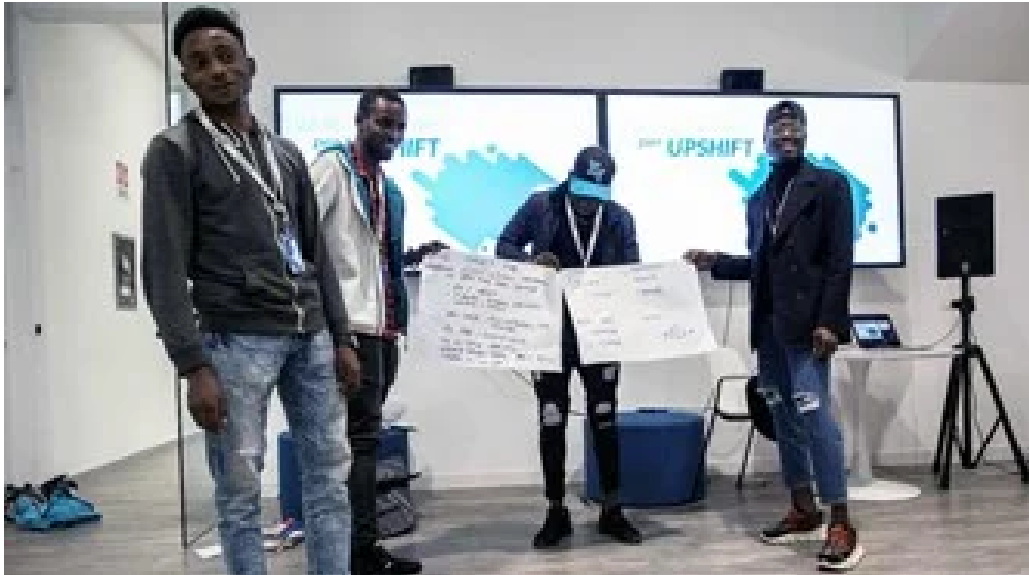
Empowering young migrants and refugees in Italy through 21st century skills building