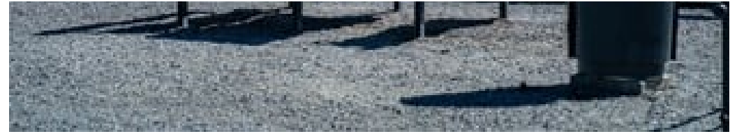
The certificates of Hydro's greener brands feed into digital product passports